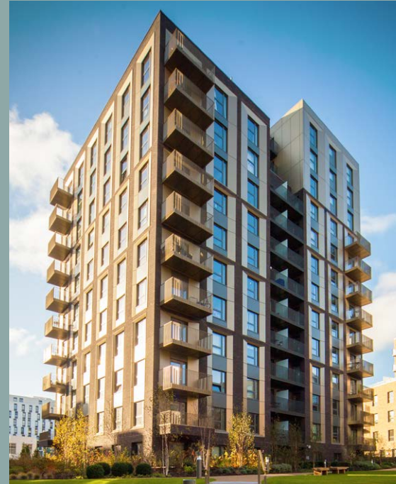
MONTANA & DAKOTA

Each Quintain Living building has its own unique personality and design - which one's right for you?